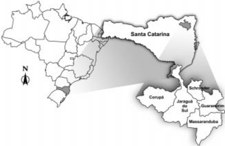
Figure 1. Map of the Itapocu River Valley, Santa Catarina State, Brazil, with indication of the cities infested by Culicoides paraensis (Goeldi, 1905).

sites described in Table 1. Infested sites were signaled in Jaragua do Sul (533 km 2 ) and Corupa (405 km 2 ), the two cities with the biggest claims (Fig. 2). The species were identified based in the Atlas of Culicoides (Wirth et al., 1988) and in the key and diagnostic characters of Culicoides of the paraensis species group that can be found in Felipe-Bauer et al. (2003).